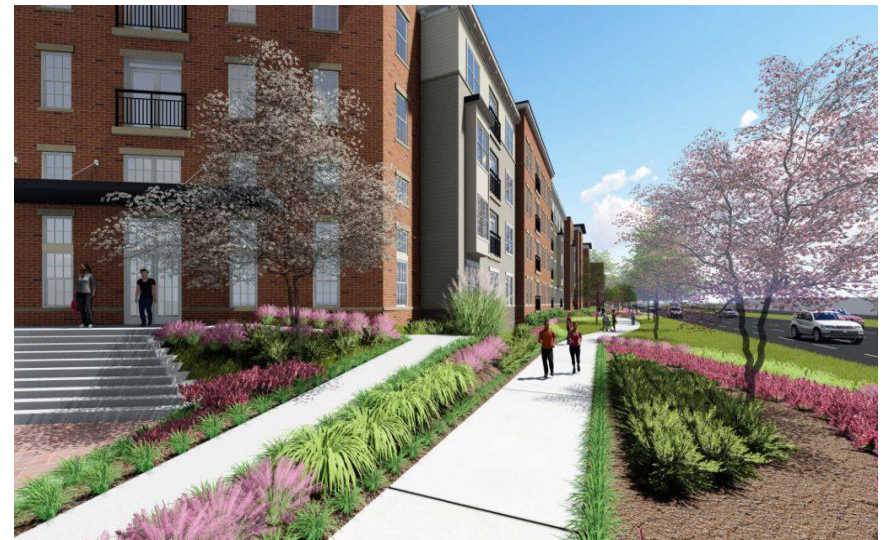
Located on Tidewater Drive next to Ruffner Middle School